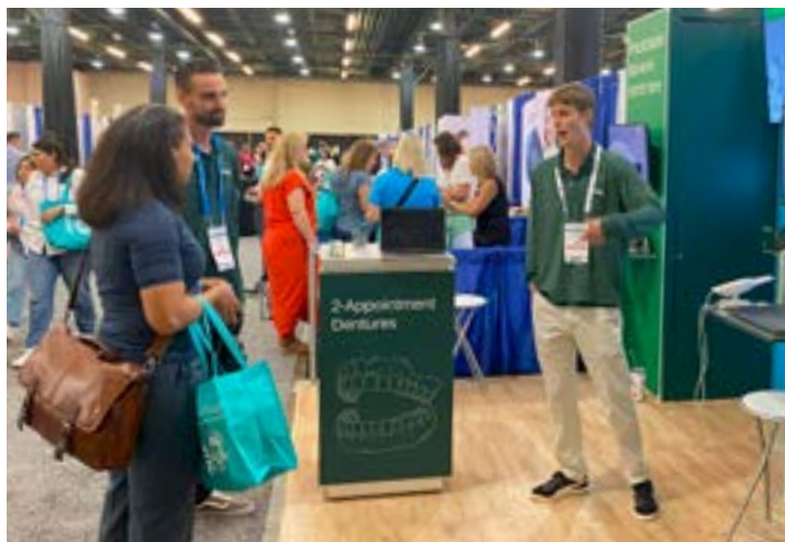
EXHIBIT HALL HOURS FRIDAY 9:00 A.M. - 6:00 P.M. SATURDAY 9:00 A.M. - 1:30 P.M.